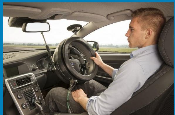
SR60 Torus-S steering robot

A range of motors are available to suit all types of test applications. AB Dynamics robots can be used with an external data capture system and also include built-in multi-channel data capture to minimise the total hardware required in the vehicle. AB Dynamics steering robots can work in conjunction with AB Dynamics pedal, gear changing and clutch robots.