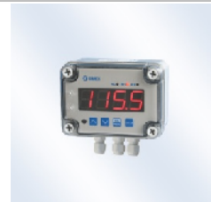
Wall mounted digital indicator