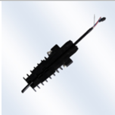
Cable support hanger