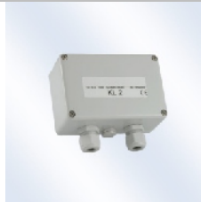
Cable Terminal Box with Vent