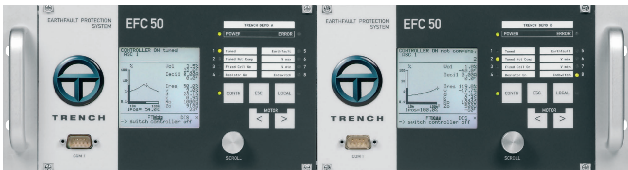
Fig. 4 Earthfault Compensation Controller EFC50

For a detailed description, refer to our brochure Earth-fault Compensation Controller EFC50/EFC50i.