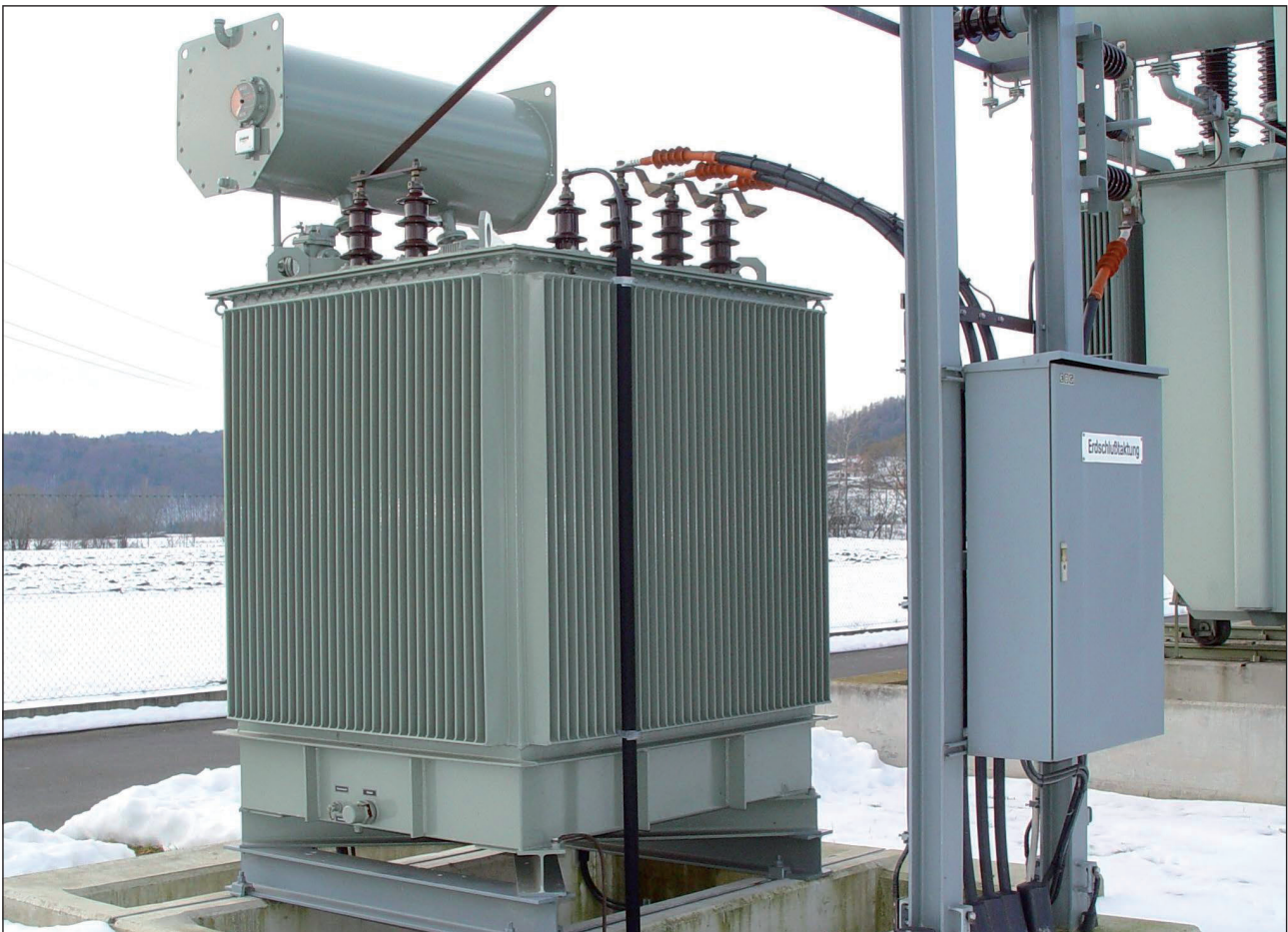
Fig. 1 20 kV / 433 A Neutral Earthing Aggregate

As a consequence, more and more utilities are implementing this type of neutral earthing technique in their distribution networks. The high reliability of our products, and our field-proven designs, have positioned Trench Austria as a leading supplier wherever electric energy is transmitted and distributed. Tailor-made solutions, including composite Neutral Earthing Aggregates, complete with associated control and protection devices, make up our well-proven product range for earthing of power systems.