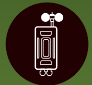
WIND SPEED TRANSMITTER