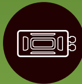
ASCII SERIAL OUTPUT