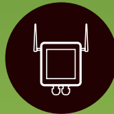
TRANSMIT TO MOBILE